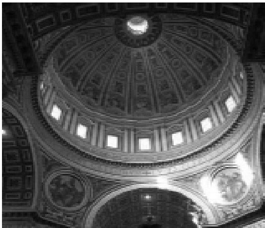
Fig 8. St. Pietro

An over-scaled, convex -concave "billboard" surmounted by a huge oval niche, proclaims it to be a small church. On its roof, a domed lantern is paired with a columned tower, twisted at forty-five degrees to inflect toward this important crossroad.