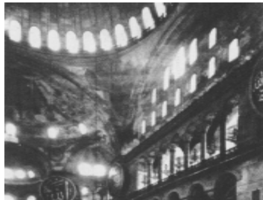
Fig 6. St. Andrea Church

Renaissance could transform the spiritual spaces of middle ages by invoking solid and geometrical designs. Instead of changing the world a calm place under God's command, the Renaissance made humanism as the main axis. Circular plan became the symbol of controlling dynamic energy in axis and organizing space.