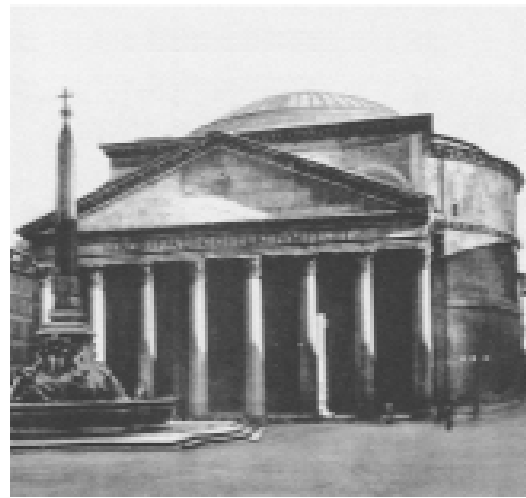
Fig 3. Exterior of Pantheon

Pantheon, which was rebuilt during the 2nd century after consecutive fires, hosts the light under its great dome in the forms of daylight and sunlight. Both literal and metaphorical use of lighting presents the sense of space together with the divine beauty (Semes, 2005:54). The daylight diffuses gently in the interior space while the sunlight falls directly from the oculus and moves whole day on the coffers of the inner dome surface. These two contrary movements transform the sunlight and the daylight from natural to spiritual ones. Visitors perceive these natural lights once they stand beneath the oculus. In other words, the sunlight gives visitors the feeling of the power of nature or they perceive the divinity via daylight.