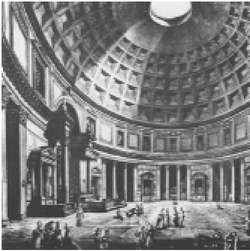
Fig 2. Interior Pantheon

Pantheon, which was rebuilt during the 2nd century after consecutive fires, hosts the light under its great dome in the forms of daylight and sunlight. Both literal and metaphorical use of lighting presents the sense of space together with the divine beauty (Semes, 2005:54). The daylight diffuses gently in the interior space while the sunlight falls directly from the oculus and moves whole day on the coffers of the inner dome surface. These two contrary movements transform the sunlight and the daylight from natural to spiritual ones. Visitors perceive these natural lights once they stand beneath the oculus. In other words, the sunlight gives visitors the feeling of the power of nature or they perceive the divinity via daylight.