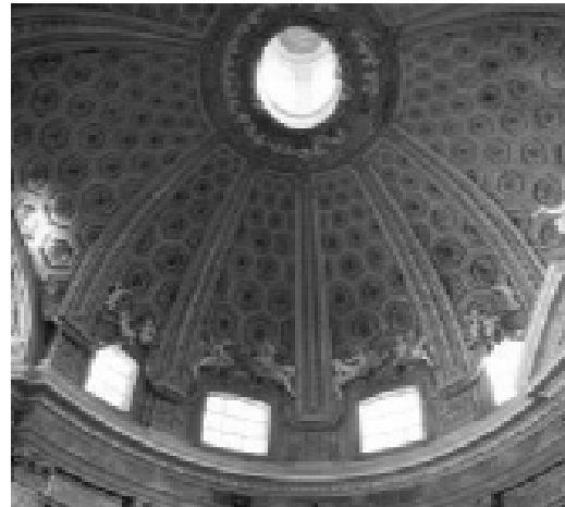
Fig 7. St. Andrea

dramatic shadows and illuminating the opposite wall with an ethereal glow.