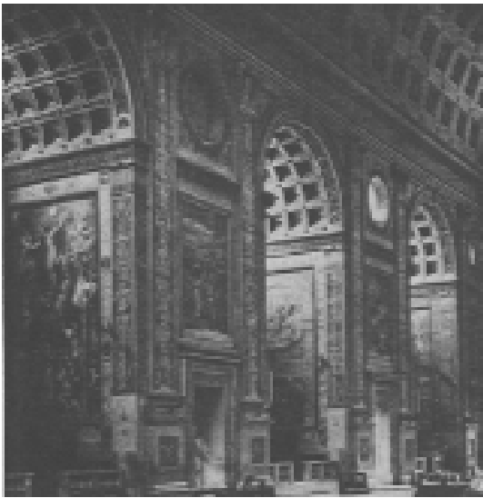
Fig 5. Interior of Hagia Sophia

Visitors are amazed with the light of Hagia Sophia to the extent that it gives them impression of coming from God's heaven onto heaven on earth. The perfection of Byzantine churches which was carrying one's sight upwards towards the central dome (Wixom, 1997:23), reached to their culmination in Hagia Sophia that was unique of its kind (Cormack, 1998:98). The daylight reflecting from the golden mosaics was taken as a solution for illuminating the interior space (Ertug, 1992:7) and could be evaluated as supporting the gloomy level of overwhelming spiritual light.