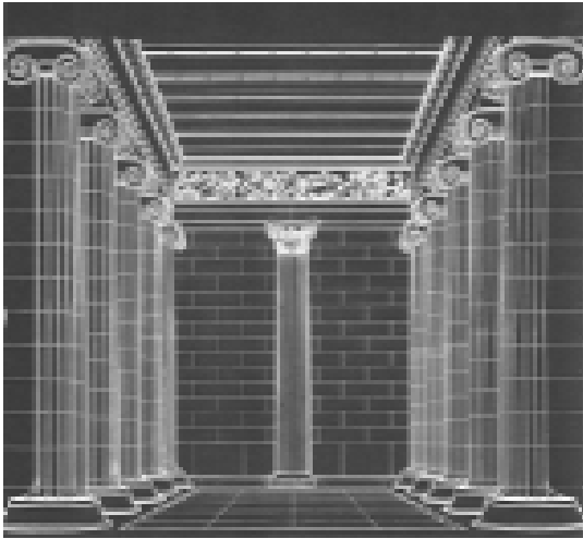
Fig 1. Apolon Temple

It was widely believed that “temple should be predominant among other structures” (Gardner, 1991:45). A temple structure, as usual, consisted of one or two rooms called naos . These rooms have a single door without any window but occasionally there were porticos or two stones between projected walls.